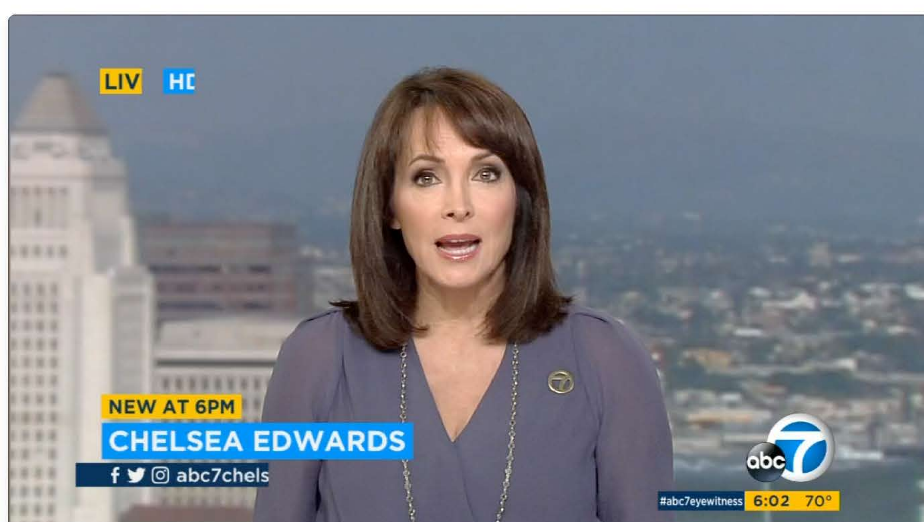
Seven former city of Beaumont officials were charged Tuesday in connection to a public corruption case of nearly $43 million in city funds.

BEAUMONT, Calif. (KABC) -- Seven former city of Beaumont officials were charged Tuesday in connection to a public corruption case of nearly $43 million in city funds.