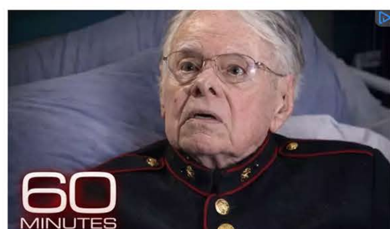
Alzheimer's Has Been Linked to This Common Drink Daily. Do Yo...

The individuals are suspected of illegally taking $36.6 million in TUMF money.